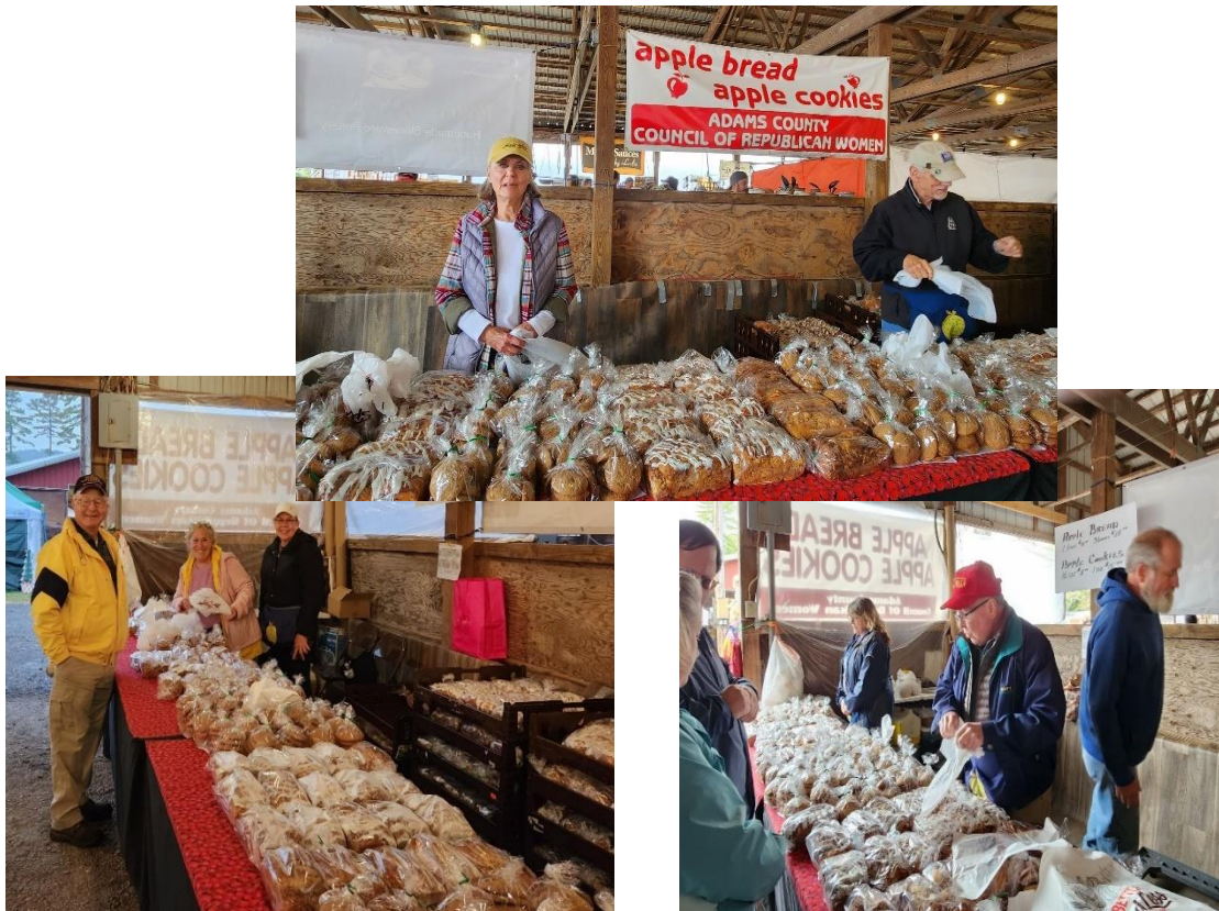
ACCRW Members and Volunteers 2023