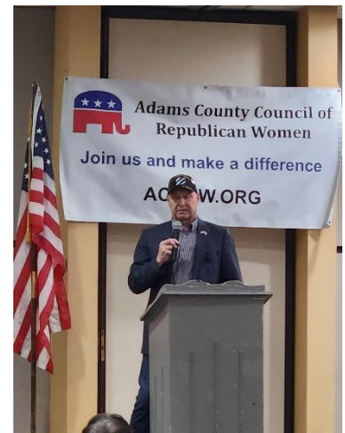
PA Senator Doug Mastriano