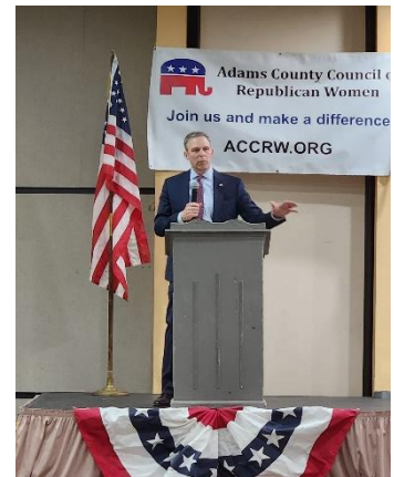
U.S. Rep Scott Perry