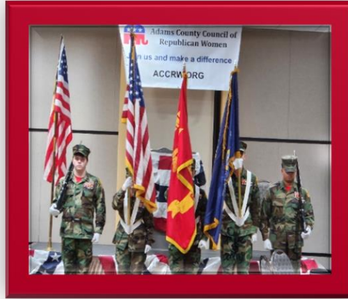
Young Marines Color Guard